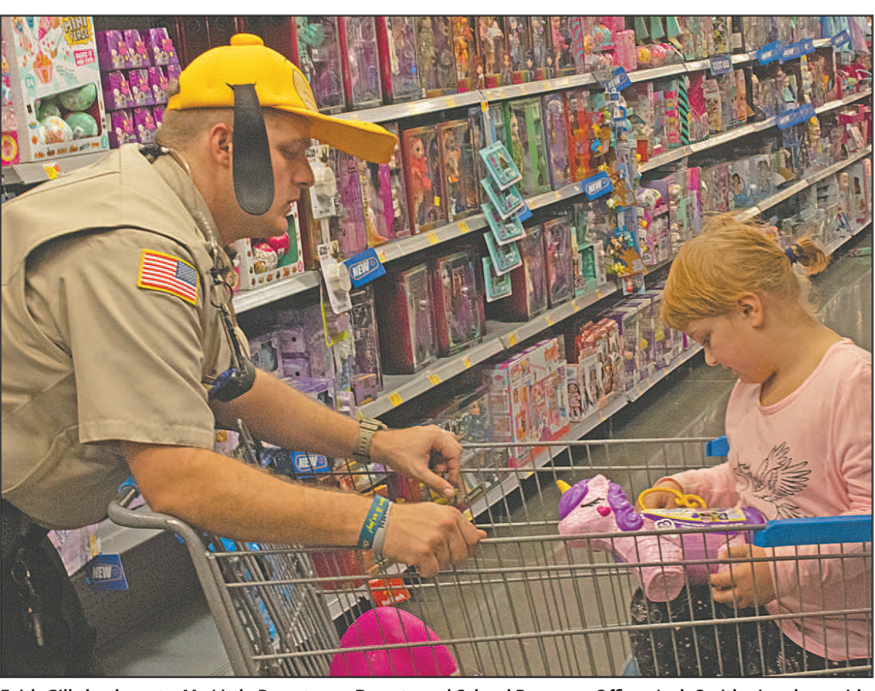
in the cart.